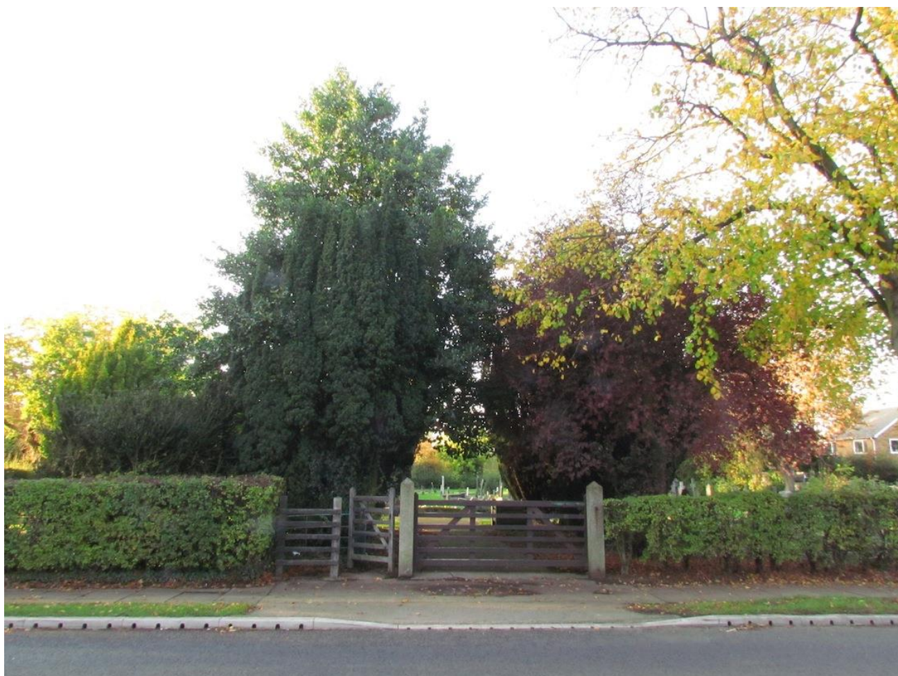
Arksey Old Cemetery

The Old Cemetery, which includes all ten burials from the First World War, is on the North side of the road. The New Cemetery, which includes all fourteen casualties from the Second World War, is just opposite it, on the South side of the road.